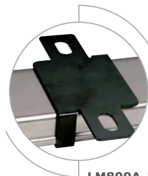
LM800A-2 LM1000A-2 5580-2