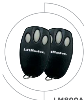
LM800A-2 5580-2 LM3800A RDO800